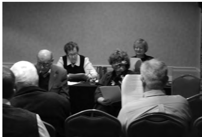
The Clients bloodstaining in NYC