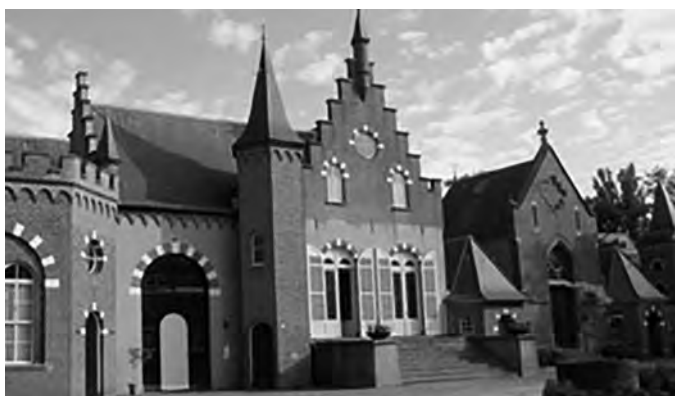
The modern Huize Doorn

About two years ago Vikas Sonak and Jelle Otten discovered that five books written by Wodehouse were still standing on the bookshelves in Huize Doorn ( Plum Lines , Spring 2013). Unfortunately, the Knights could not view the books during this visit.