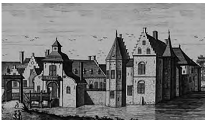
Huize Doorn in its original incarnation

ON THE AFTERNOON of Saturday, November 22, the Knights paid a visit to Huize Doorn, near the village Doorn. Huize Doorn is a manor house, purchased by the last German emperor, Wilhelm II, to be his residence-in-exile following his abdication of the German throne after World War I. Emperor Wilhelm II was Queen Victoria's eldest grandson. This resulted in the emperor's interest in English literature and specifically P. G. Wodehouse.