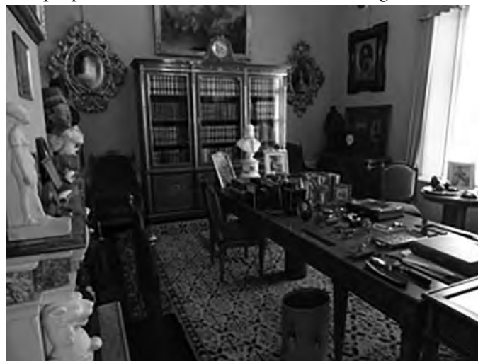
Wilhelm II's bookshelf at Huize Doorn