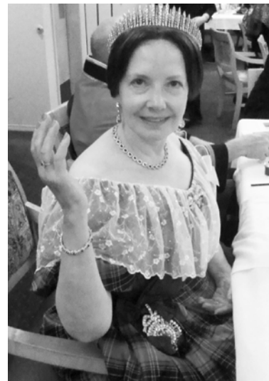
Queen Victoria was delighted by the proceedings.