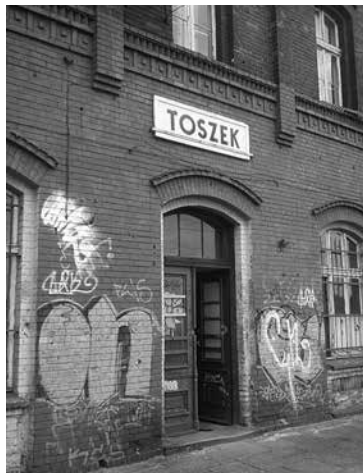
Outside the Toszek train station, "modernized" by spray painters

What has enabled me to be here is my job as a freelance travel writer. One of my regular assignments is to visit Poland for the publisher Lonely Planet, and to update guidebooks as they come due in the schedule. I've always wanted to make the pilgrimage to Plum's temporary wartime home. On this occasion