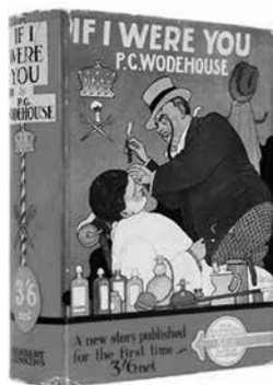
W. Heath Robinson

it is true that Herbert Jenkins rarely employed first-rate talents, although one well-known British artist, W. Heath Robinson, produced the jacket for If I Were You . If it looks like there are a lot of spray bottles and tonics in this barber shop, it might help you to know that Heath Robinson was the Rube Goldberg of the U.K., famous for drawing pictures of unnecessarily complicated machinery.