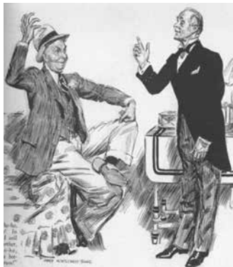
James Montgomery Flagg and his aging Bertie

Unlike Morgan, Flagg was less interested in recreating entire scenes than he was in giving us close-up snapshots of individual characters. His Jeeves is often pictured with a wry smile; as with Uncle Sam, Flagg’s Jeeves is probably a self-portrait. Like Charles Dana Gibson before him, Flagg excelled at drawing glamorous women. I don’t think Flagg was ever really comfortable when drawing Bertie. Early artists like Tony Sarg and Alfred Leete might be excused for drawing an older Bertie, as