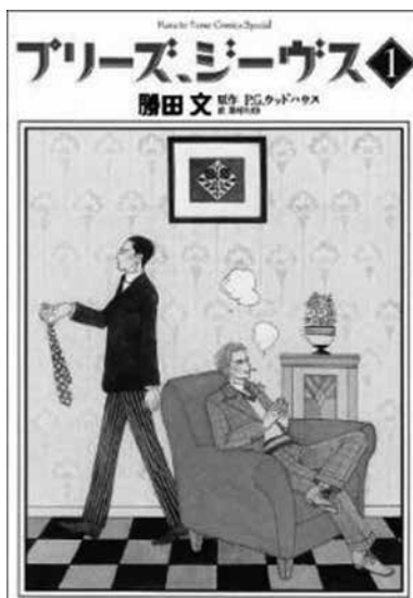
The manga Please, Jeeves

There are problems common to translation in any language, and then there are problems that are specifically inherent in Japanese translation. As an