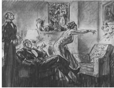
Wallace Morgan portrays the demise of the Infant Samuel.

As a Wodehouse illustrator, Morgan was less interested in producing detailed character sketches than he was in picturing the overall scene. Often with just a few strokes, he could capture the absurdity or good nature of the situation. One of my favorites is from The Code of the Woosters : note Jeeves’s stiff upper lip and Bertie’s insouciance as Aunt Dahlia lets heave the Infant Samuel at Prayer.