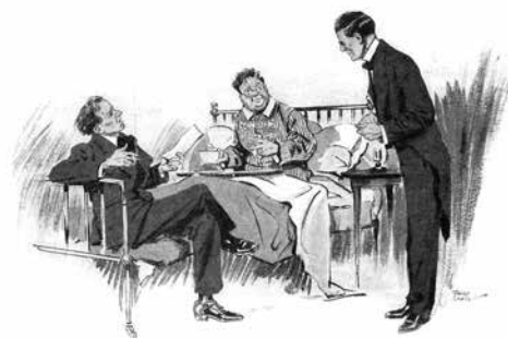
Tony Sarg's pudgy Bertie