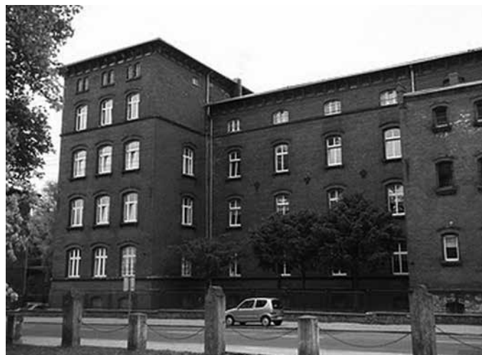
The psychiatric hospital, which served as a prison to PGW and others in WWII

The first few buildings are too modern to be Wodehouse’s prison. Luckily, I have the relevant photocopied pages from my copy of Robert McCrum’s masterful Wodehouse: A Life in my satchel, so I peek at it for a description. Sure enough, further on I find McCrum’s “brooding, dark red-brick building”; a massive, grimy structure with two jutting wings thrust to the edge of the pavement, and bars on its central windows. It was presumably from here that Wodehouse could “watch everyday life passing up and down the road outside.”