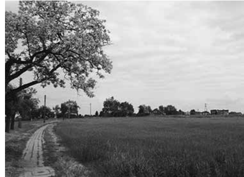
On the not-so-well-marked, but peaceful, path to Toszek

But Fate, as we know, has a way of slipping up behind one with a bit of lead piping. Past the station building, I find myself on a quiet country road lined by trees, with no town in sight. Google Maps has been a bit vague about the location of the station in advance, and now that I'm on the ground, Hell's foundations are quivering a little. But my iPhone soon sorts me out—it's a left turn along ul Dworcowa (Station St) into town.