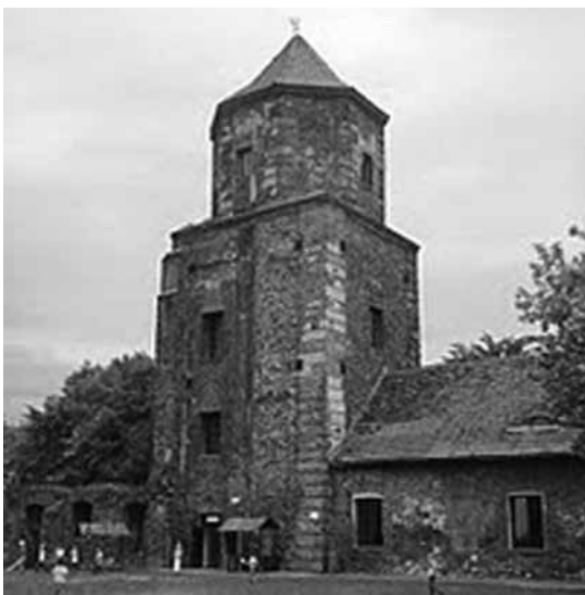
Within the walls of Toszek castle