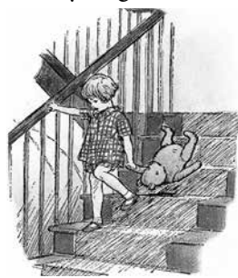
Drawn by E. H. Shepard

how about the artist behind the familiar folks to the left? He is, of course, E. H. Shepard, whose drawings have become synonymous with Milne's characters. Now, for the edition of The Inimitable Jeeves that you see to the right, who were the artists? The Inimitable Jeeves (or Jeeves as the book was titled in the U.S.) is arguably Wodehouse's most famous; it is the one the New York Public Library selected for its "Books of the 20th Century" exhibit. But, I repeat, who were the artists? Or, consider the early jackets from Carry On, Jeeves —the artwork is better, but I suspect you don't know who drew them either.