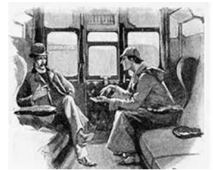
Sidney Paget's work

LET'S BEGIN with a quiz. I'm sure everyone can name the characters pictured to the upper right and I suspect most of you also know the name of the artist. Yes, it was Sidney Paget, who illustrated 38 Sherlock Holmes stories for the Strand Magazine . And