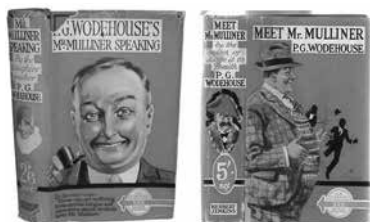
Not Plum's favorite