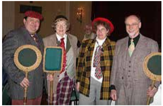
The NEWTS bookies prepare to rake in the oof. (DB)