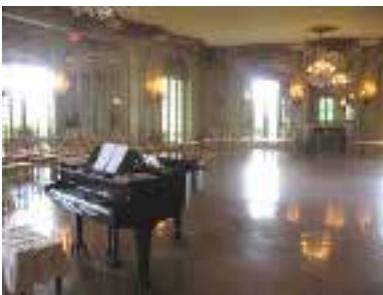
The Astor mansion ballroom (TM)