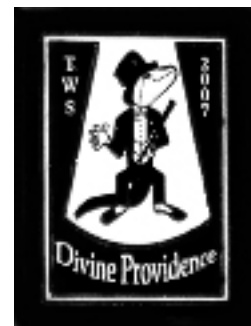
Who can resist a newt with their morning coffee?