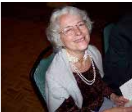
A luminous Plummy reads the convention keepsake. (TR)