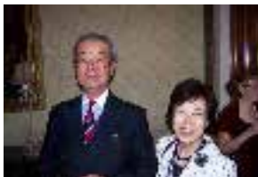
The Iwanagas in a merry mood (TR)