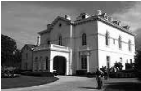
Beechwood Mansion