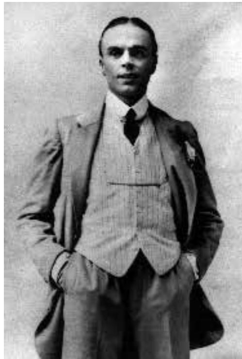
George Grossmith in a Bertian pose

As I said at the convention, I had to wait over 30 years to read those words—but it was well worth it!