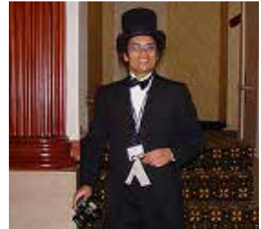
Pongo poses between snaps. (BC)