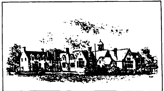
HANLEY CASTLE GRAMMAR SCHOOL — circa 1910