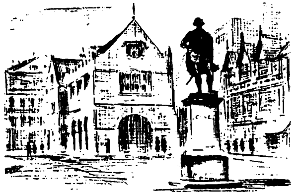
The Square, Shrewsbury

(From The First Cuckoo , a selection of the most witty, amusing and memorable letters to The Times , 1900-1980. George Allen & Unwin, publishers.)