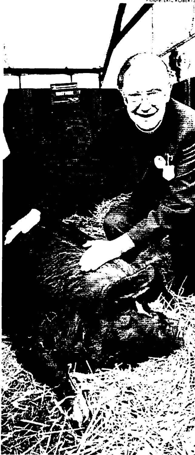
The Archbishop with Portia, another of his pigs, which won a first prize at the Kent Show last July