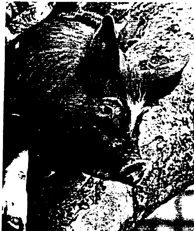
Harriet: died after fighting a leaner, younger sow